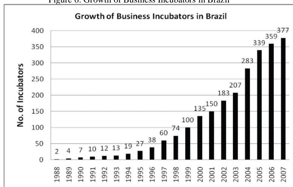
Figure 6: Growth of Business Incubators in Brazil

Brazil is the leading country in the incubation business in Latin America as in terms of number of incubators in operation and annual growth rate. Brazil is the fourth ranking business incubation market in the world. Incubators in Brazil have witnessed meteoric growth from just two in 1988 growing to nearly 400 in 2007 (Chandra, 2007). Other countries like Mexico, Chile and Colombia followed the same. Table 4 shows the growth of business incubators in Brazil.