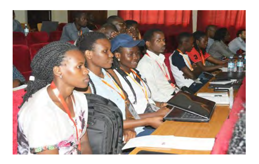
Participants at the AGRC, 1 = 2 August 2019