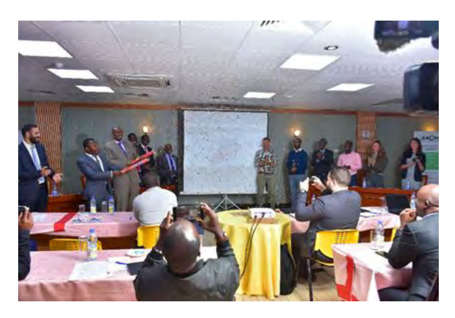
Launch of Energy Access Explorer

EACREEE engaged with the World Resources Institute (WRI), the Uganda's Energy Sector GIS Working Group and other partners to establish an open, unified, regional energy and economic development space in East Africa by setting up an energy geo-visualization observatory platform. The platform aim at boosting knowledge management, networking, advocacy and strengthening capacities on renewable energy and energy efficiency, acting as a catalyst for policy development and energy planning. The online GIS platform called the Energy Access Explorer (<a href="https://www.energyaccessexplorer.org/">https://www.energyaccessexplorer.org/</a>) has been developed and was launched on 4th September 2019 and is now being improved. The Energy Access Explorer will provide decision makers, project developers, investors and other stakeholders with tailored information to establish an initial critical assessment of the energy situation.