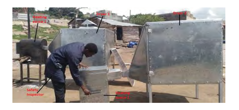
CTDD officer measuring temperature on heating source chamber