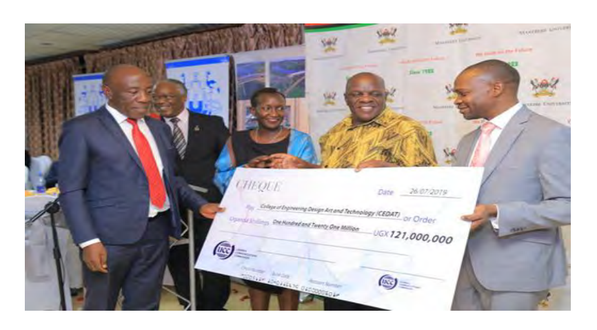
CEDAT Principal receives a cheque of UGX121 million from UCC for a research conference

The guests at the dinner showed their sincere love and support to the college by raising funds that shall be used for renovation and rehabilitation of the old building and support towards research; UGX60M and UGX 370M was collected in cash and pledges respectively. Some of the stakeholders who committed funds towards research, translation and dissemination. These include; Uganda Communications Commission towards hosting a conference on telecommunications, National Water and Sewerage Corporation towards research in the water and waste water related areas, Uganda Electricity Generation Company Ltd towards research in the energy related areas and Kiira Motors Corporation committed funds towards research on vehicle and transportation.