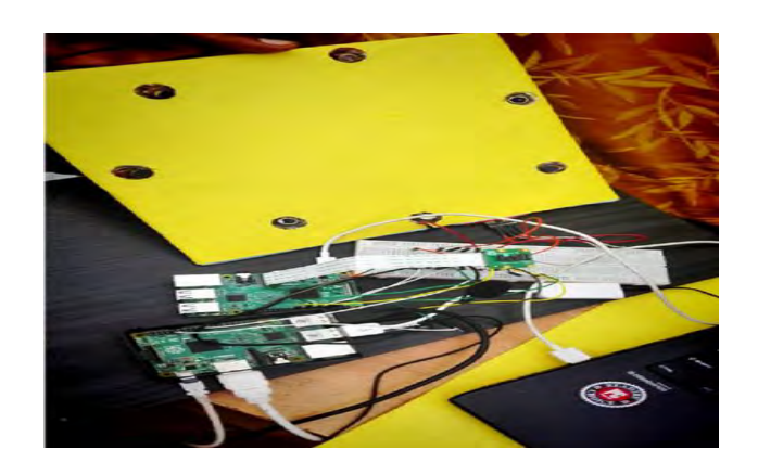
The KatiNdaba Prototype Version 3

vibrations delivered on the person's skin. The proximity and directional feedback shall be communicated via a pair of vibrating bracelets whose intensity of vibration is inversely proportional to the distance from the detected obstacle. Additionally, the bracelets shall help the wearer know the direction of the detected obstacle, by majoring vibration on the left bracelet for a left oriented obstacle and the right bracelet for a right side oriented obstacle relative to where the wearer is facing.