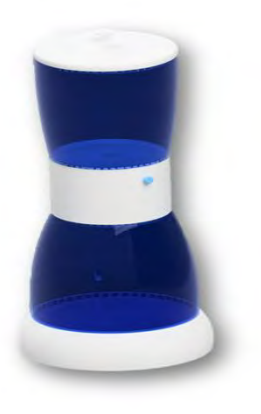
Prototype of the VepoX filter

A study by Lin et al., 2015 reported that the activated carbon with multiple micro/mesopores can be used as functional water purifying material. As activated carbon has a developed pore structure, it can adsorb the trace amounts of organic contaminants in water and significantly reduce dissolved nitrates, the chemical oxygen demand and total organic carbon in water (Omri et al., 2013). It is also effective on the turbidity and chromaticity of the physical standards for drinking water.