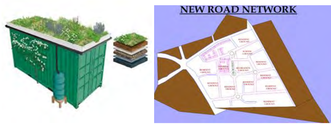
Planned development at Kasubi