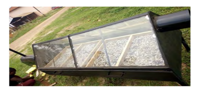
Hybrid fish dryer drying silver fish