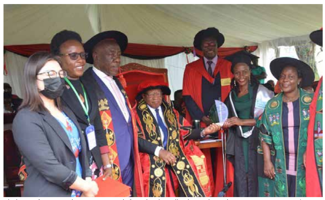
The best performing students receive awards from the Chancellor during the graduation ceremony, May 27th 2022.

The College presented its graduating students during the 72nd Graduation Ceremony on Friday 21<sup>st</sup> May 2022. Below is a summary of students who graduated.