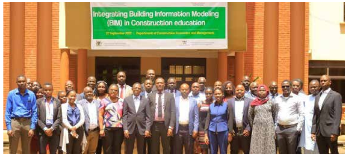
Participants in the Stakeholder engagement in Integration of Building Information Modelling (BIM) into Construction Education take off time to pose for a picture in front of the CEDAT Building, 22<sup>nd</sup> September 2022

CEDAT is at the lead in as far as developing technologies is concerned by its nature and the kind of teaching and learning exposures offered. A number of innovations were unveiled in the period under review.