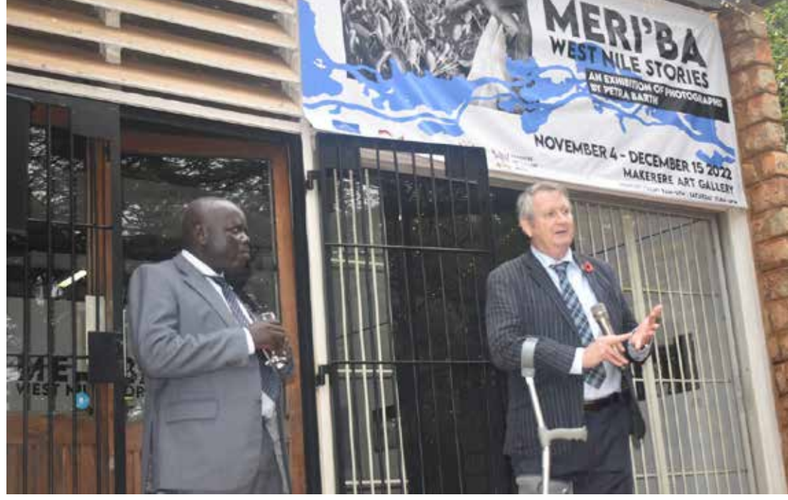
Art exhibition about the West Nile stories ran from the 4th to 15th December 2022 at the Institute of Heritage, Conservation and Restoration.

Metallization of Uganda's Iron Ore. The study seeks to develop technology for application of gaseous reducing agents in direct reduction of Uganda Iron ores. The improvement of the processes is expected to add value to Uganda's iron ore by use of hydrogen.