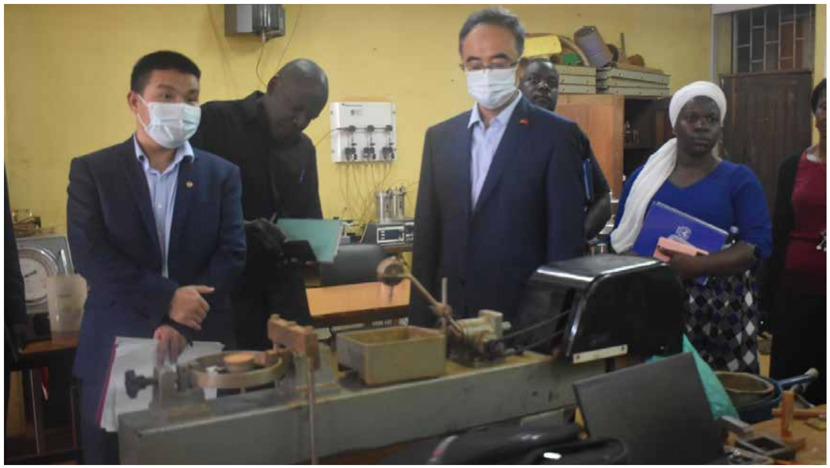
CCCC visiting team inside one of the Laboratories at CEDAT

school. Among the recommendations made was that the school of engineering needed to designate reading space for graduate students, drawing timetables for master's programs across the schools as well as ensuring that departments had strategic plans for guided approaches in recruitments in addition to involving graduate students as stop gap measures to address the staff shortage challenge.