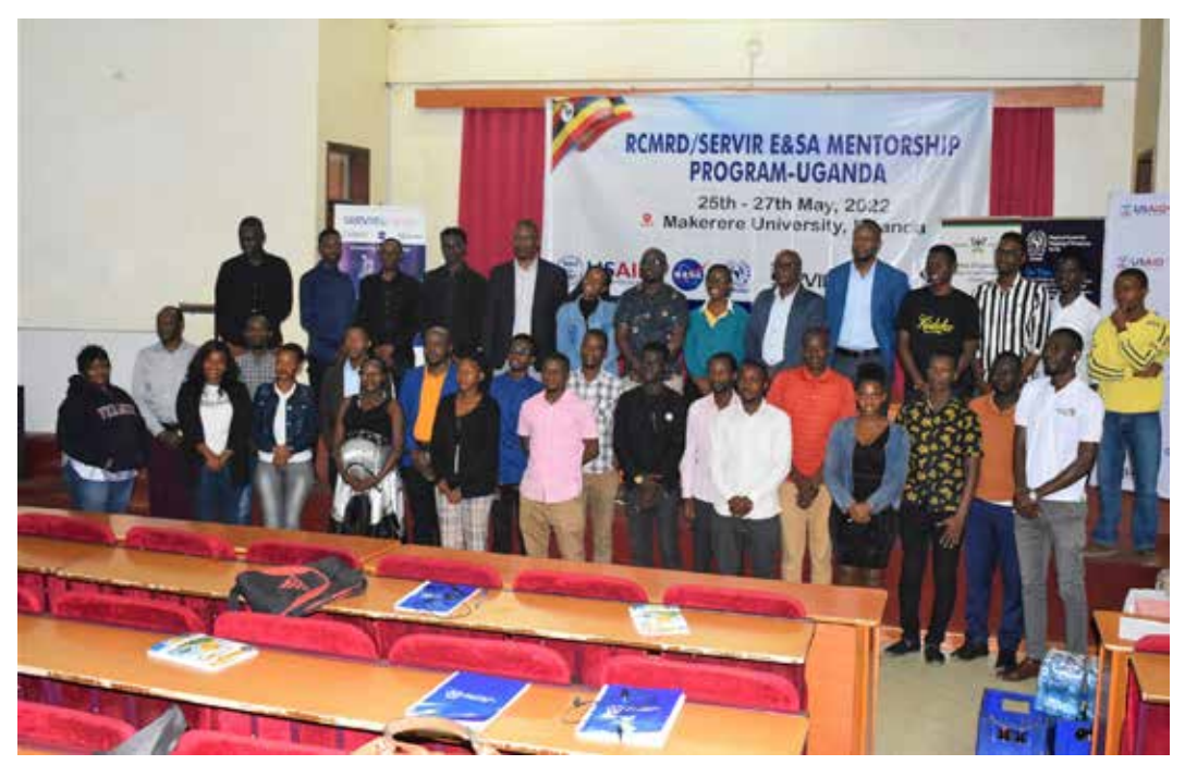
Students pose for a picture during the training

They were trained from 25th to 27th May 2022 at CEDAT conference hall and some of the areas covered included access of Earth Observation data, available platforms, and Earth Observation data-based methods for natural resource monitoring. The workshop also had an exhibition of state-of-the-art Earth observation technologies from which students were tasked and grouped to present their ideas and innovations in solving the country's environmental problems.