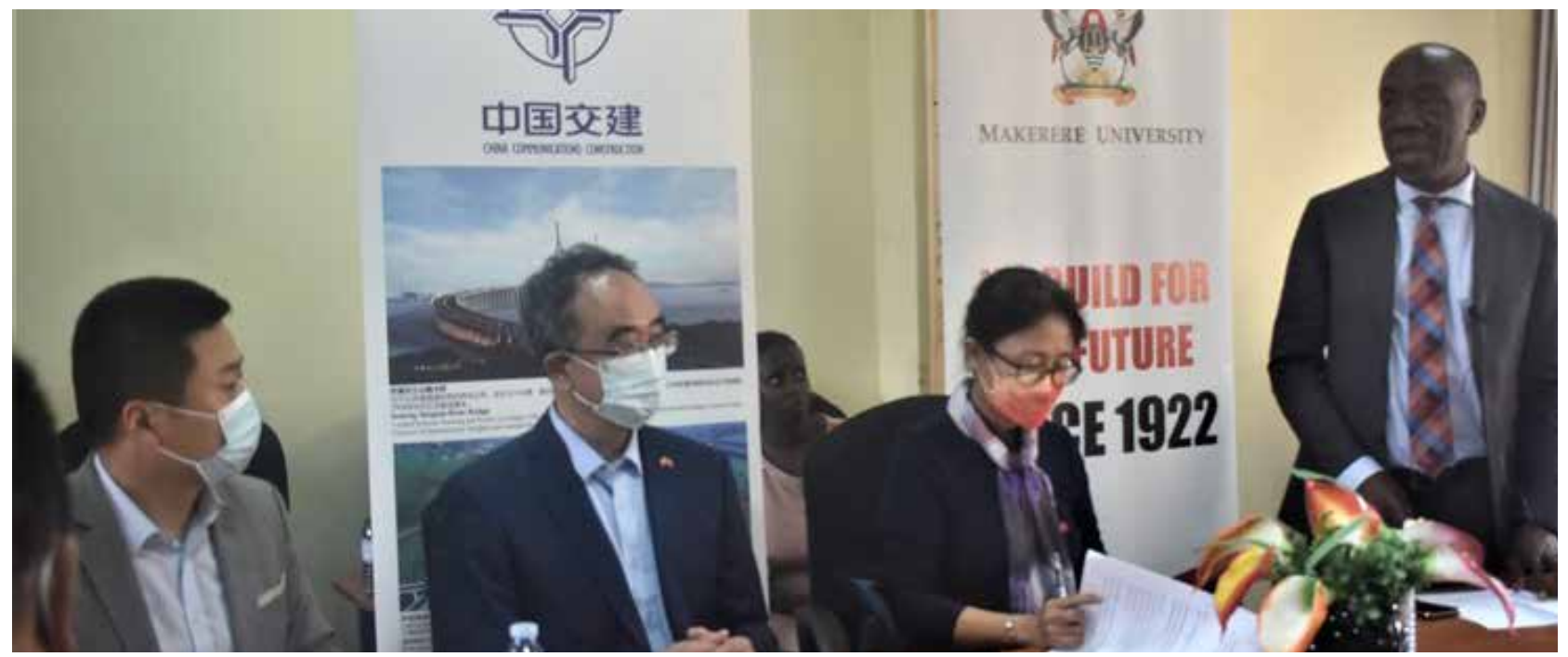
Ag. DVCFA & Principal CEDAT (R) makes his remarks after signing the MOU

The two institutions came into an agreement to support the realization of their objectives when they signed a memorandum of understanding on November 2nd 2022. Engineering students and staff at CEDAT will get opportunity for hands on training from Chinese company, China Communications and Construction Company (CCCC) after signing a Memorandum of Understanding.