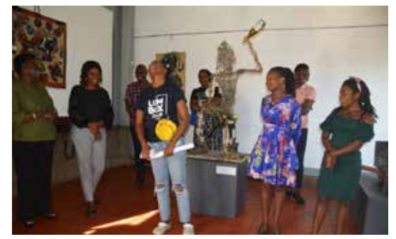
Excited students explain their work

A one week's Art exhibition featuring work by Sculpture students was held from 20<sup>th</sup> to 26<sup>th</sup> July 2022 at the Institute of Heritage, Conservation and Restoration, Makerere Art Gallery.