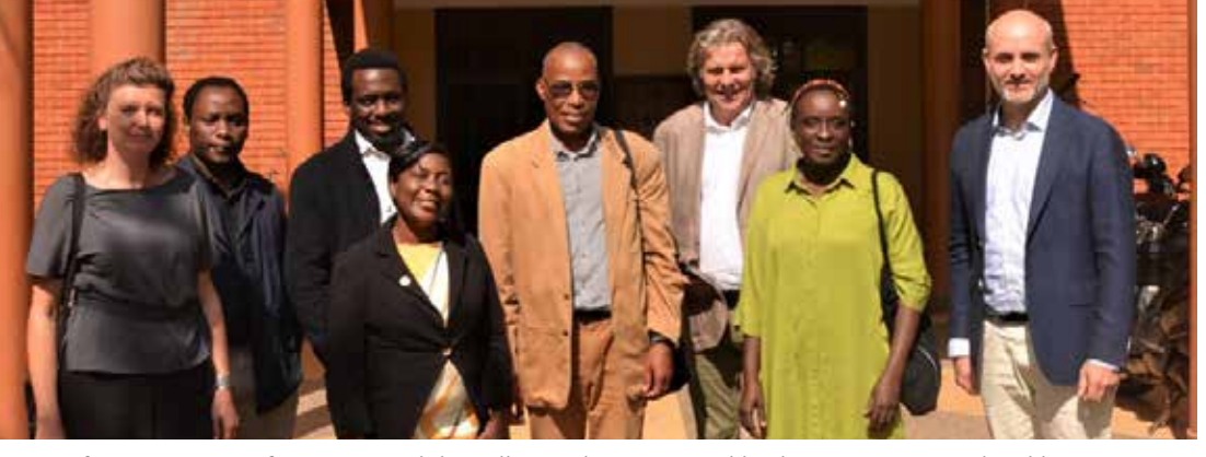
A Team from University of Bergen visited the College and were received by the Deputy Principal and her team

The University of Bergen (UIB), Faculty of Art, Music and Design entered into a partnership with MTSIFA to work towards internalizing and nurturing local indigenous knowledge. The project will contribute to a multidisciplinary internationalization of higher education between global south and north with art, design, music, involving the two universities and independent enterprises linked to these disciplines.