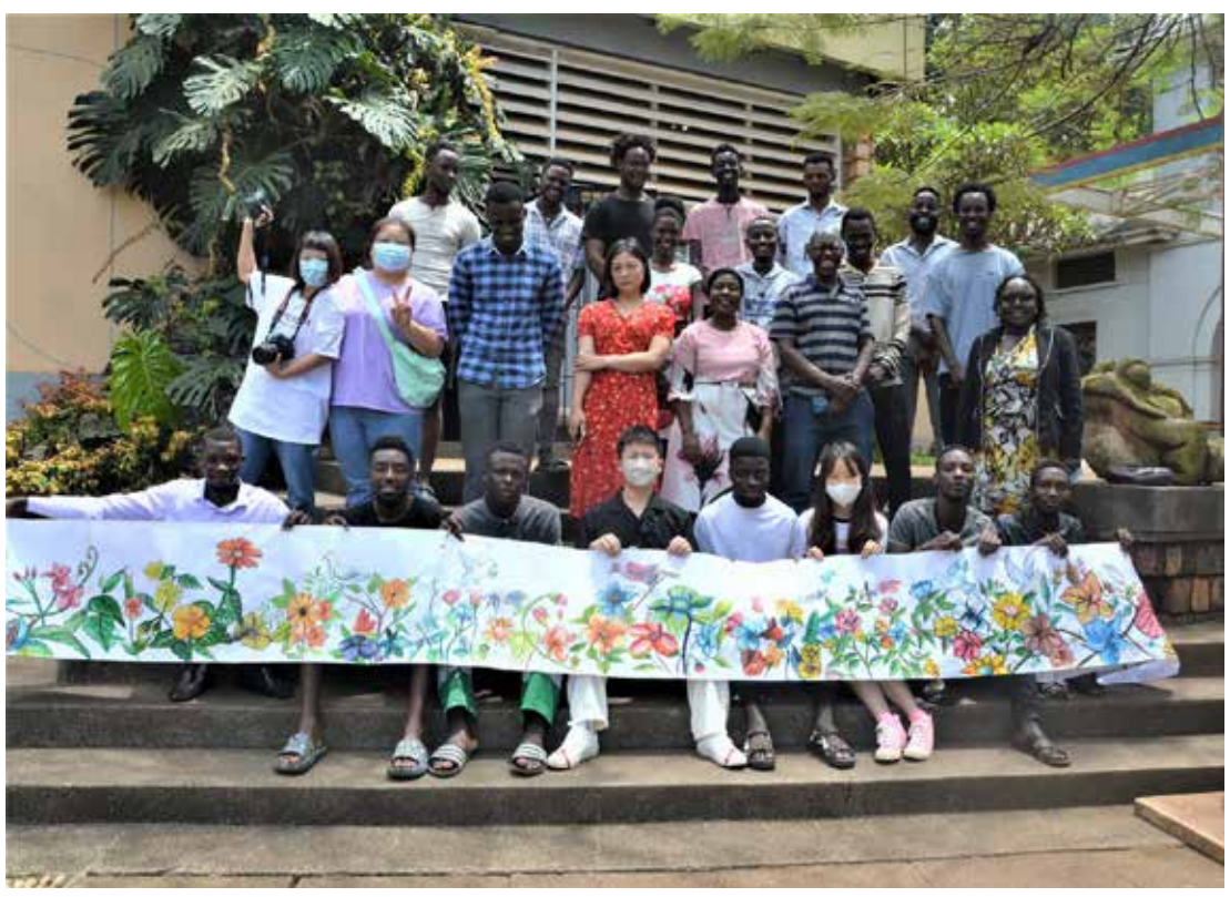
The Art work displayed by the students

celebrated the Mak@100 in a unique style with messages packaged in a seven-meter flower painting using acrylic on paper.