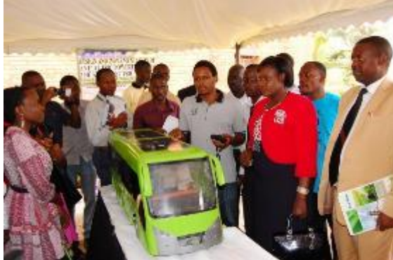
A model of the KAYOOLA

The project last year started working on another vehicle after the completion of the Kiira EV. This time round, the team is working on computer vehicle- 36- seater bus code named KAYOOLA.