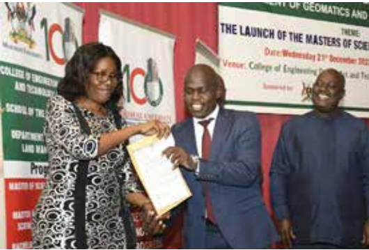
Hon. Judith Nabakooba, Minister of Lands, Housing and Urban Development hands over world bank scholarships to 10 Masters Students

The program comes in at a time when the country is grappling with a number of land related challenges that include among others land rights for women, the elderly and the marginalized groups, encroachment on the fragile ecosystem in search for fertile soils for cultivation, fraud in land transactions, as well as land fragmentation due to increased population among others.