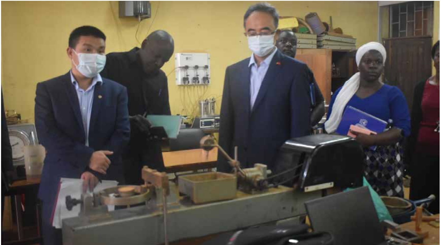
CCCC visiting team inside one of the Laboratories at CEDAT

school. Among the recommendations made was that the school of engineering needed to designate reading space for graduate students, drawing timetables for master's programs across the schools as well as ensuring that departments had strategic plans for guided approaches in recruitments in addition to involving graduate students as stop gap measures to address the staff shortage challenge.