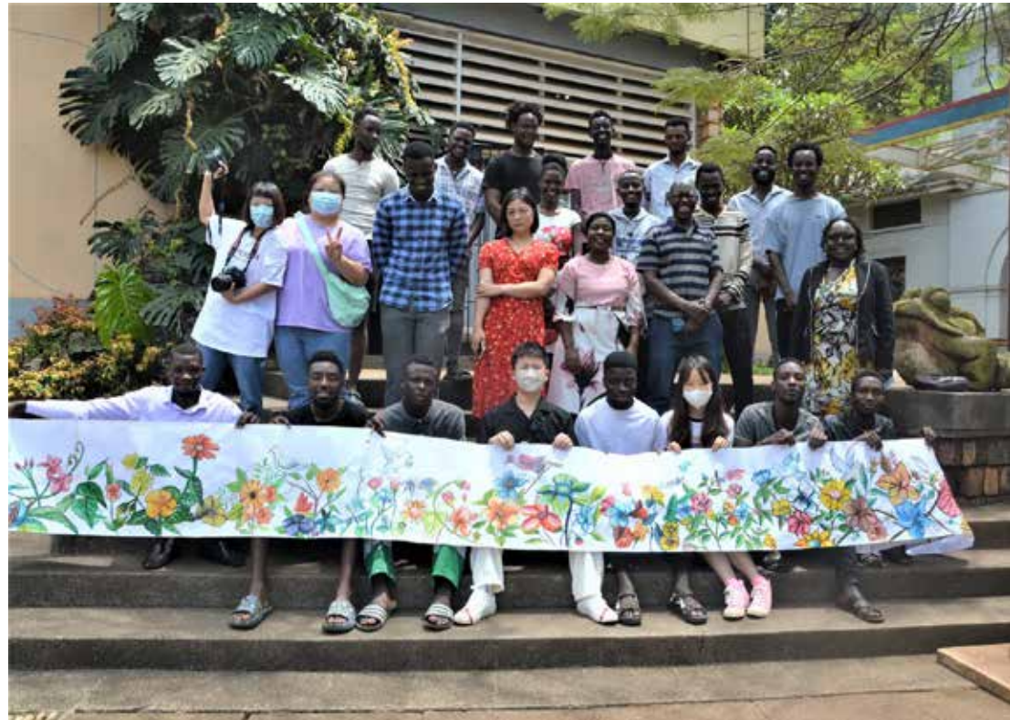
The Art work displayed by the students

celebrated the Mak@100 in a unique style with messages packaged in a seven-meter flower painting using acrylic on paper.