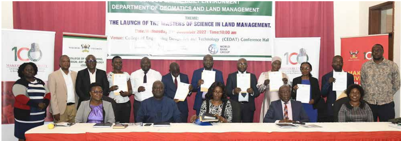
The Minister for Lands, Housing and Urban Development, Hon Judith Nabakooba, CEDAT staff and Scholarship beneficiaries pose for a photo at the Launch of the MSc Land Management Program on 21st December 2022.

The Master of Science in Land Management program offered by the Department of Geomatics and Land Management at the College of Engineering, Design, Art and Technology (CEDAT) was formerly launched on Wednesday 21st December 2022. The event was presided over by the Minister of Lands, Housing and Urban Development, Hon. Judith Nabakooba. Ten of the Fifty pioneer students of the two-year program that started during the academic year 2022/2023 received