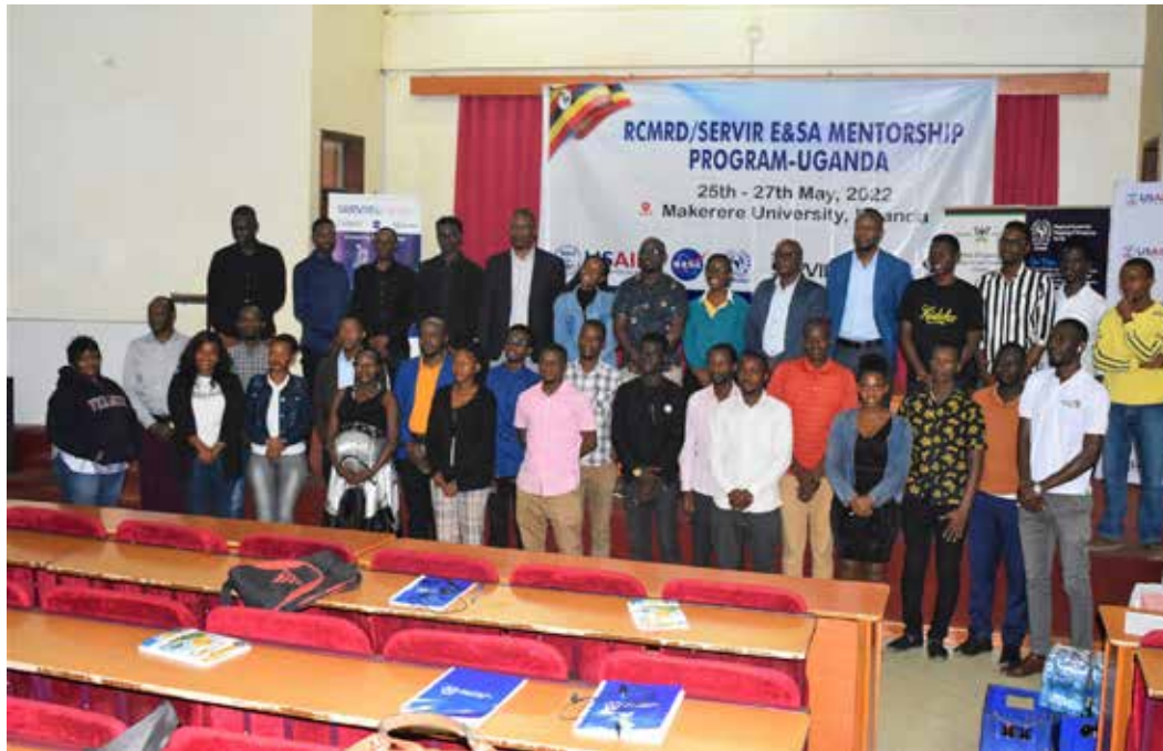
Students pose for a picture during the training

They were trained from 25th to 27th May 2022 at CEDAT conference hall and some of the areas covered included access of Earth Observation data, available platforms, and Earth Observation data-based methods for natural resource monitoring. The workshop also had an exhibition of state-of-the-art Earth observation technologies from which students were tasked and grouped to present their ideas and innovations in solving the country's environmental problems.