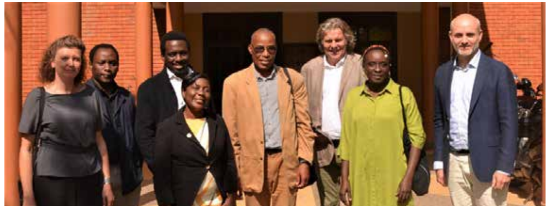
A Team from University of Bergen visited the College and were received by the Deputy Principal and her team

The University of Bergen (UIB), Faculty of Art, Music and Design entered into a partnership with MTSIFA to work towards internalizing and nurturing local indigenous knowledge. The project will contribute to a multidisciplinary internationalization of higher education between global south and north with art, design, music, involving the two universities and independent enterprises linked to these disciplines.