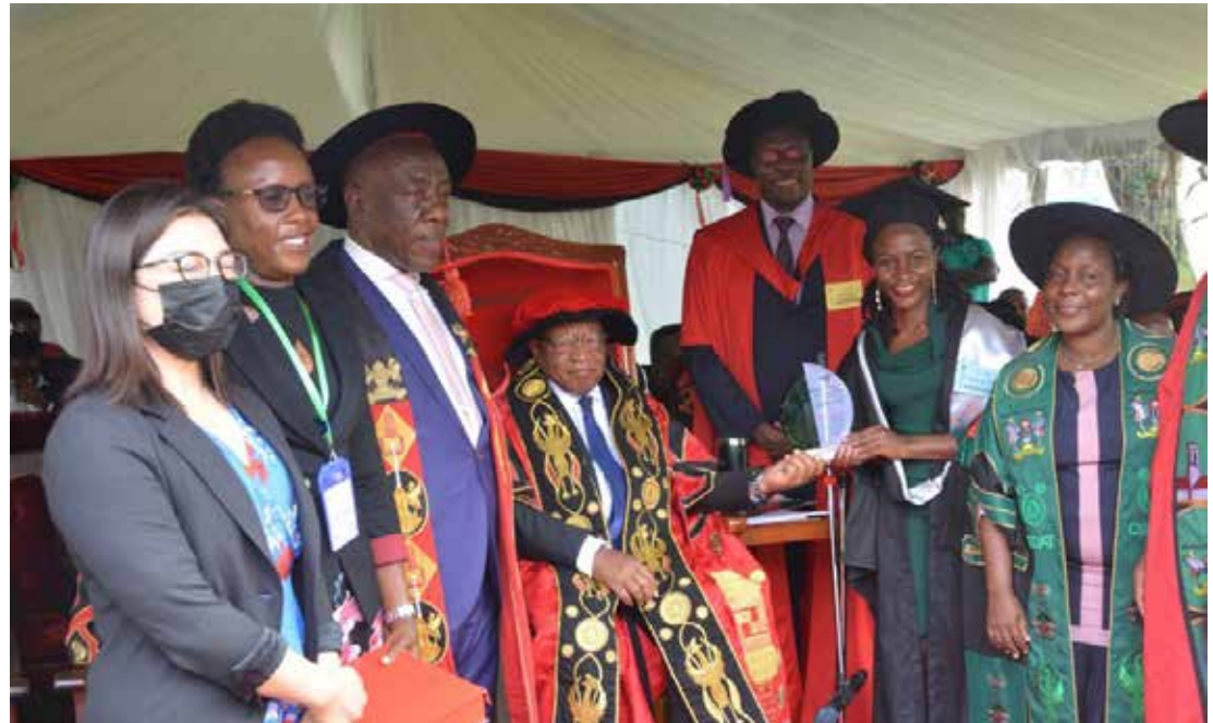
The best performing students receive awards from the Chancellor during the graduation ceremony, May 27 th 2022.

The College presented its graduating students during the 72nd Graduation Ceremony on Friday 21 st May 2022. Below is a summary of students who graduated.