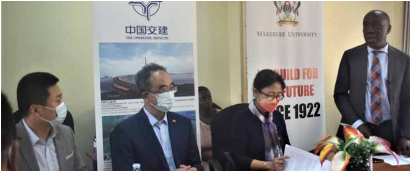
Ag. DVCFCA & Principal CEDAT (R) makes his remarks after signing the MOU

The two institutions came into an agreement to support the realization of their objectives when they signed a memorandum of understanding on November 2nd 2022. Engineering students and staff at CEDAT will get opportunity for hands on training from Chinese company, China Communications and Construction Company (CCCC) after signing a Memorandum of Understanding.