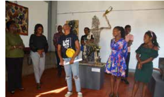
Excited students explain their work

A one week's Art exhibition featuring work by Sculpture students was held from 20 th to 26 th July 2022 at the Institute of Heritage, Conservation and Restoration, Makerere Art Gallery.