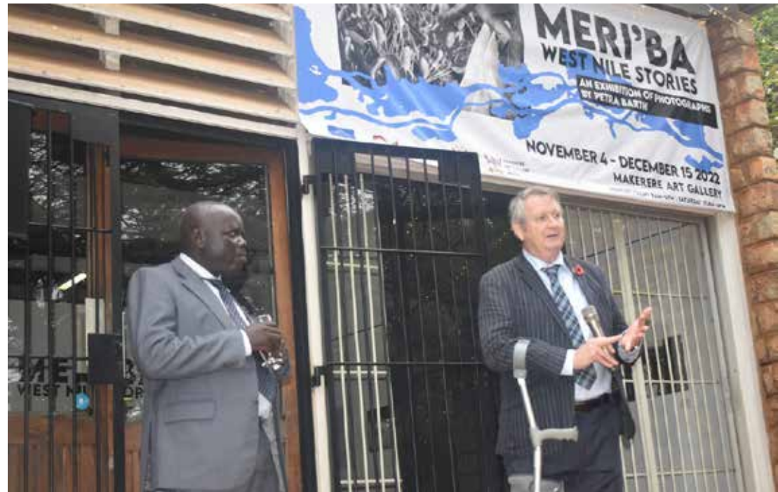
Art exhibition about the West Nile stories ran from the 4th to 15th December 2022 at the Institute of Heritage, Conservation and Restoration.

Metallization of Uganda's Iron Ore. The study seeks to develop technology for application of gaseous reducing agents in direct reduction of Uganda Iron ores. The improvement of the processes is expected to add value to Uganda's iron ore by use of hydrogen.