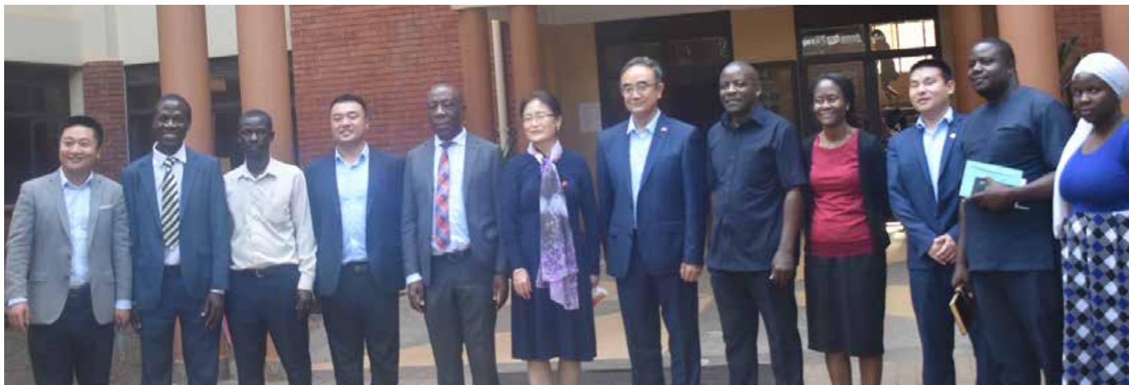
The DVCA F&A poses for a picture with staff from CEDAT and CCCC on 2nd November 2022 following the signing of the MOU.

A number of research dissemination workshops were held with the view of sharing information and knowledge generated in the course of implementing projects. Some of the fora was used to add value to the work through validation seminars organized both at unit or departmental levels. The following are worth mentioning.