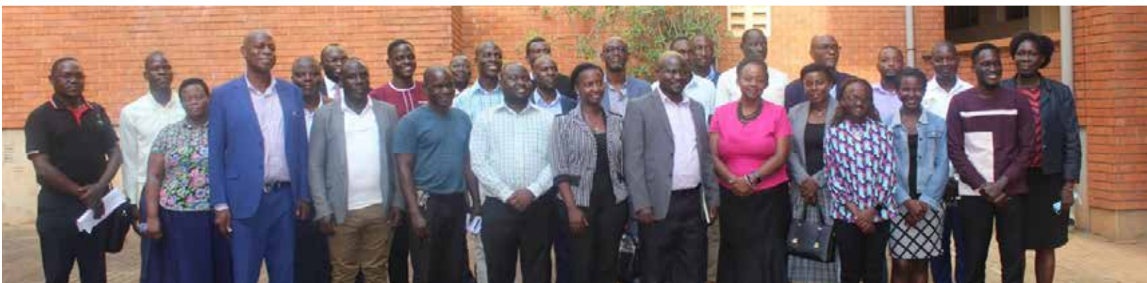
A stakeholder engagement held on Thursday 10 th November 2022 to discuss accomplishments in the 1 st of the 3-year UNESCO China Funds –in -Trust project phase III.