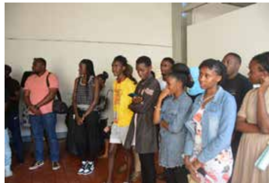
Third year Sculpture students exhibited their work

A one week's Art exhibition featuring work by Sculpture students was held from 20 th to 26 th July 2022 at the Institute of Heritage, Conservation and Restoration, Makerere Art Gallery.