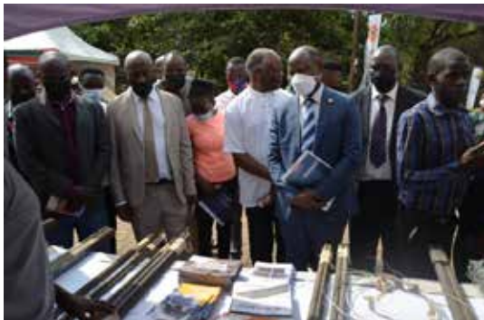
Prof. Barnabas Nawangwe inspects an exhibition by makers of Building materials during the Fundis training at CEDAT

The department of Architecture and Physical Planning conducted a training for masons and fundis as a way of sharing information and experiences for improved services. This was done in partnership with makers of building materials that include Uganda clays, Steel and tube, plascon pain as well as the National Building Board.