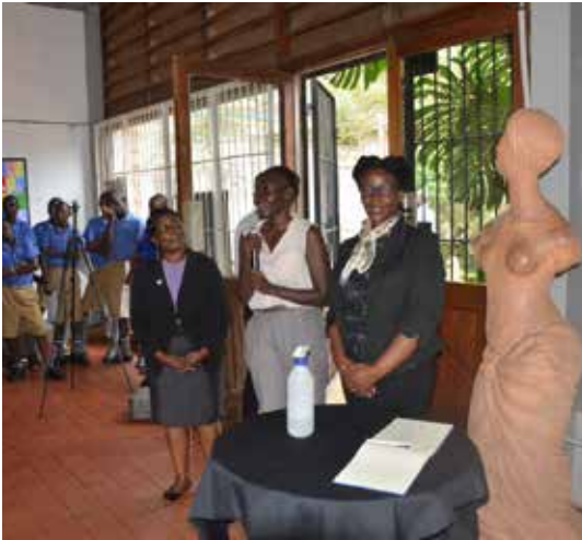
Children with Disabilities fashion show at MTSIFA