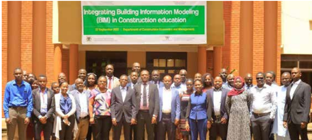
Participants in the Stakeholder engagement in Integration of Building Information Modelling (BIM) into Construction Education take off time to pose for a picture in front of the CEDAT Building, 22 nd September 2022

CEDAT is at the lead in as far as developing technologies is concerned by its nature and the kind of teaching and learning exposures offered. A number of innovations were unveiled in the period under review.